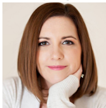
Crossley Properties LLC

Sign up today by calling 484-577-4243 or by emailing becareplus@berksencore.org